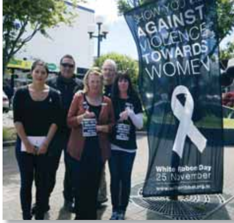
Representatives of Taupo community service groups raised awareness of family violence on the recent White Ribbon Day.

Projects planned for 2012 include progressing the consideration of a possible Family Centre; holding a funding forum; revamping the